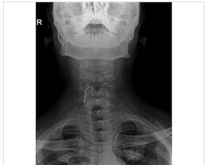
Figure 3. Neck X-ray in coronal view of the fishhook stuck in the anterior subcutaneous fat of the neck, midline position. Note that the upper airways are intact