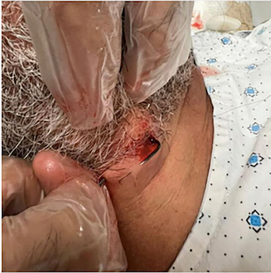
Figure 5. Successful advancement and cutting technique of the fishhook