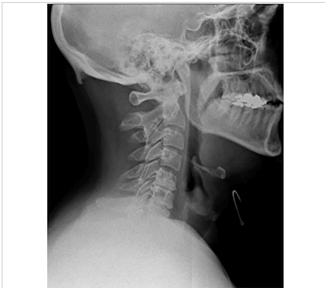
Figure 2. Neck X-ray in sagittal view of the fishhook stuck in the anterior subcutaneous fat of the neck, midline position. Note that the upper airways are intact