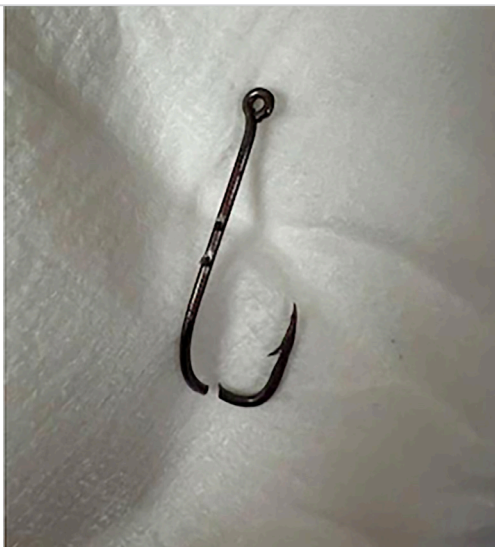
Figure 6. J-type fishhook with its barb