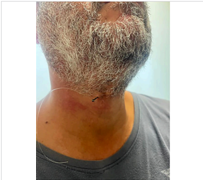
Figure 1. Fishhook in the neck upon patient presentation to the emergency department

The hook was removed in the radiology room under local anesthesia with lidocaine injections to the anterior neck. The hook was advanced to pierce the skin, externalizing its tip. The sharp tip and barb were cut and separated from the rest of the hook using a ring cutter and forceps, and the remaining smooth part was then retrieved Figures 5-6. A post-procedural US confirmed no acute injury to major vessels and no hematoma. The patient tolerated the procedure with minimal discomfort. He received a tetanus vaccine and was discharged home the same day with a course of amoxicillin-clavulanic acid.