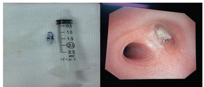
Figure 2. Foreign body specimens removed