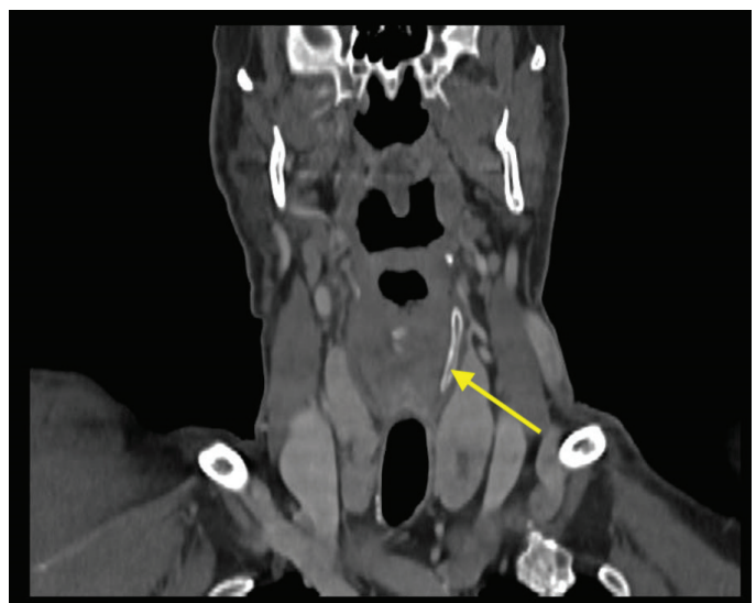
Figure 2. Computed tomography image in the coronal plane showing absence of the right superior thyroid cornu. The yellow arrow shows the left superior thyroid cornu for comparison