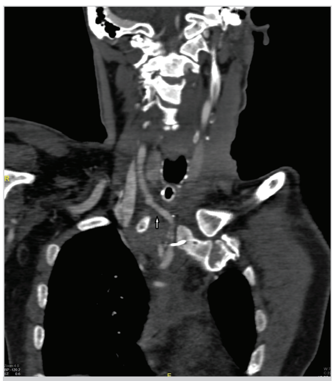
Figure 3. Computed tomography angiography done at sixth-month follow-up showing patent anastomosis (white arrow)

bypassing the circulation is ischemic stroke. Endovascular stenting has also been tried in poor surgical candidates with varying success rates (9).