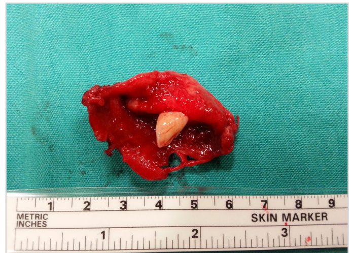
Figure 4. Post-operative view of the specimen consisting of a cyst with a small monoradicular supernumerary tooth