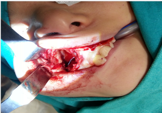
Figure 2. Defective anterior maxillary wall, destroyed by cyst expansion