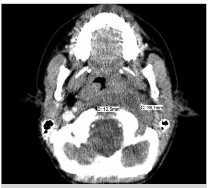
Figure 3. The axial neck CT image demonstrating the left parapharyngeal and retropharyngeal abscess in case IX. The white dotted lines C (18.7 mm) and D (12.5 mm) show the long diameter of abscesses of parapharyngeal and retropharyngeal spaces, respectively

Age, gender, DNI location, neck CT findings, laboratory results, and parameters related to antibiotic regimen are summarized in Table 1.