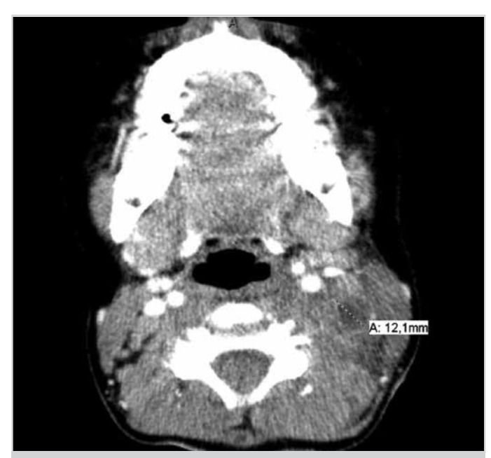
Figure 1. The view of the left posterior cervical abscess of case VII on axial neck CT. The white dotted line A indicates the long diameter (12.1 mm) of the abscess