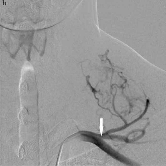
Figure 3. a, b. Digital subtraction angiography of the left subclavian artery demonstrates a hypervascularized tumor, which was fed by the thyrocervical trunk (star) and costocervical trunk (arrow)