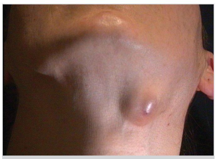
Figure 1. A female patient presenting with the complaint of neck swelling and diagnosed with tularemia

Twelve (48%) of the patients underwent abscess drainage under local anesthesia, three (12%) patients underwent mass excision operation under general anesthesia, and 10 (40%) patients received only medical treatment. The diagnoses of patients having undergone mass excision under general anesthesia were established with postoperative evaluation of tissue samples for tularemia. One patient re-applied with neck swelling in the third month after abscess drainage, and the patient was administered streptomycin and doxycycline therapy with aspiration. The mean duration of hospitalization was 5.47±1.77 days. Samples taken from 19 patients (76%) were sent for pathological examination; 13 patients (52%) were reported with cytological findings consistent with abscess content and six (24%) were reported as having granulomatous inflammatory reaction. In the examination of abscess material, 25 patients (100%)