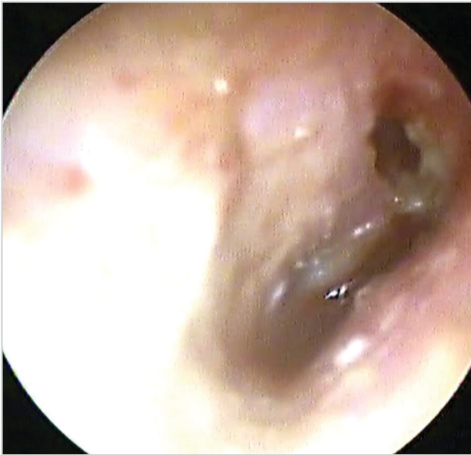
Figure 1. Acute exacerbation of chronic otitis. In the endoscopic view of the patient's ear, the middle ear is seriously edematous and draining