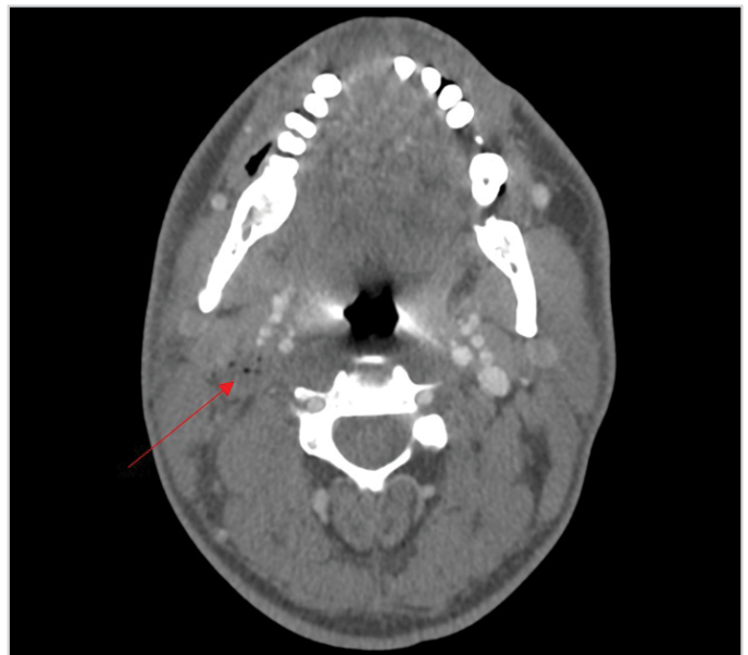
Figure 4. The red arrow shows air densities with thrombosed appearance in the right internal jugular vein in the contrast-enhanced CT angiography of the neck.

dration was initiated in addition to medical treatment and antibiotherapy during intensive care conditions. Blood culture was taken and 4x2.25-g piperacillin/tazobactam and 400-mg teicoplanin therapy was initiated in accordance with the advice of the Department of Infectious Diseases. Furthermore, topical ciprofloxacin therapy was initiated for the right draining ear of the patient. Methicillin-resistant coagulase-negative Staphylococcus and Parvimonas micra grew in the blood cultures of the patient. Because increased body temperature was observed during the follow-up of the patient, teicoplanin therapy