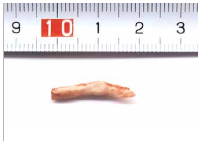
Figure 2B. Partially resected styloid process. [Color figure can be viewed in the online issue, which is available at www.turkarchotolaryngol.org]