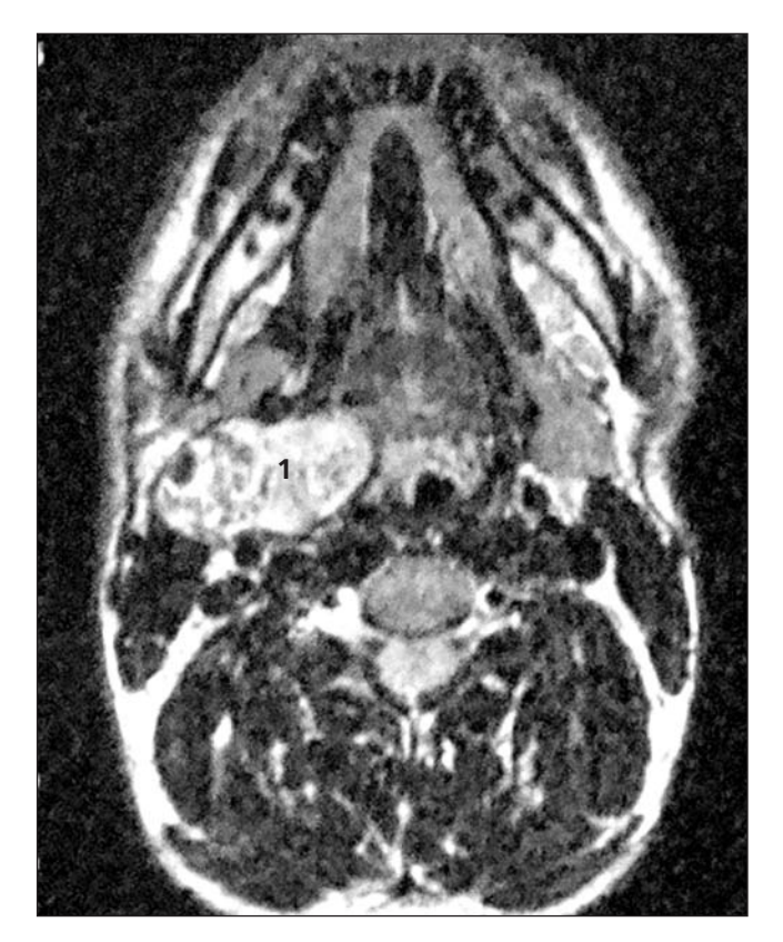
Figure 3. Pre-operative MRI scan showing a well defined, isointense, moderately enhancing mass lesion (1) presenting on adjacent structures

The case was discussed with our pathologist and an excision biopsy was planned. Under general anesthesia and endotracheal intubation, the mass was approached through an incision 2 cm below the mandibular margin. On exposure, a hard ovoid mass with well defined rounded margins was encountered arising from the hyoid bone (Figure 4). The mass appeared to be extending to the surrounding soft tissue and adhered to the submandibular gland and surrounding muscles with no definite invasion. The mass was removed in toto including part of the hyoid bone. The post operative period was uneventful with no palsies. Fifteen months after surgery, the patient remained free of tumor recurrence; he was subsequently lost to follow-up.