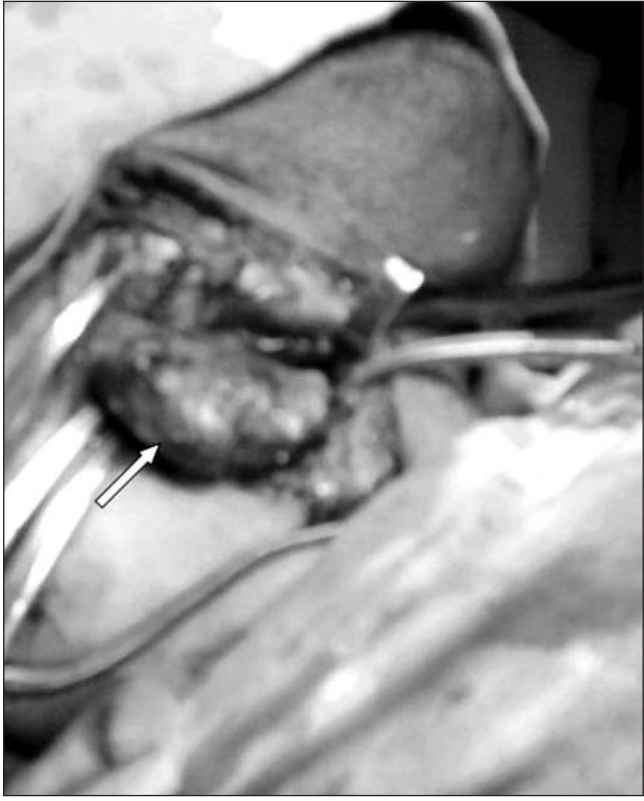
Figure 4. Operative photograph showing an ovoid mass (arrow) with well defined rounded margins arising from the hyoid bone with no extension into the surrounding soft tissue.

The case was discussed with our pathologist and an excision biopsy was planned. Under general anesthesia and endotracheal intubation, the mass was approached through an incision 2 cm below the mandibular margin. On exposure, a hard ovoid mass with well defined rounded margins was encountered arising from the hyoid bone (Figure 4). The mass appeared to be extending to the surrounding soft tissue and adhered to the submandibular gland and surrounding muscles with no definite invasion. The mass was removed in toto including part of the hyoid bone. The post operative period was uneventful with no palsies. Fifteen months after surgery, the patient remained free of tumor recurrence; he was subsequently lost to follow-up.