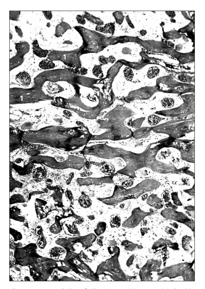
Figure 7. Histopathologic findings (HE x400). Bony trabeculae (1). Thin walled blood vessels (2) lined by single layer of endothelial cells and filled with RBCs.

The first documented case of hemangioma of hyoid bone origin that manifested as submandibu-