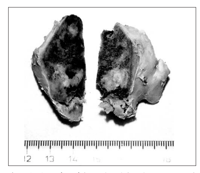
Figure 6. Cut surface of the specimen is bony in appearance and showed dark brown and grayish white.