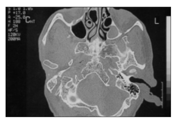
Figure 2. Axial temporal CT scans of the patient showing previously operated and diseased side.

had been present for 1 year and the patient denied any pain or bleeding. History revealed a similar lesion of the right auricle that had undergone total auricular resection without neck dissection or radiation 5 years ago, and the specimen was reported as SCC. On physical examination a 3x1.5 cm ulcerated lesion involving the lower half of the left auricle was found with no palpable neck mass. (Figure 1). Other physical findings were within normal limits as well including temporal CT findings (Figure 2), blood count/chemistry and chest radiogram. There was no evidence of locoregional recurrence on the right side and any second primary.