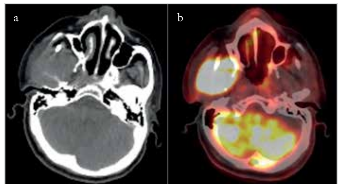
Figure 4. a, b. The axial CT section (a) and PET/CT scan (b) of a mass invading the right buccal mucosa and right maxillary sinus

amination. Most of the lesions can be visualized simply via inspection or by endoscopic evaluation. In addition, palpation of the neck, salivary glands, tongue, and base of the tongue must be performed to avoid overlooking any submucosal lesions (1). In the head and neck region, only imaging modalities can determine lesions that are not easily visualized or palpated. PET/CT scan is a valuable imaging method for systemic metastasis.