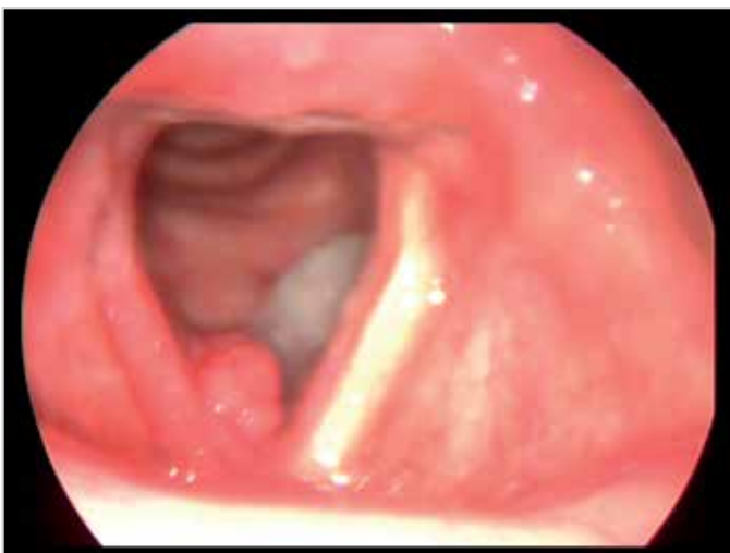
Figure 3. Figure shows the laryngoscopic examination (via a 90° rigid endoscope) of the right subglottic mass