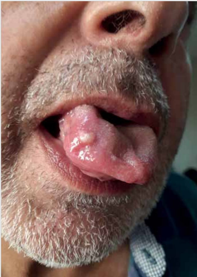
Figure 1. Tender and hemorrhagic mass on the right side of the tongue due to colon adenocarcinoma metastasis