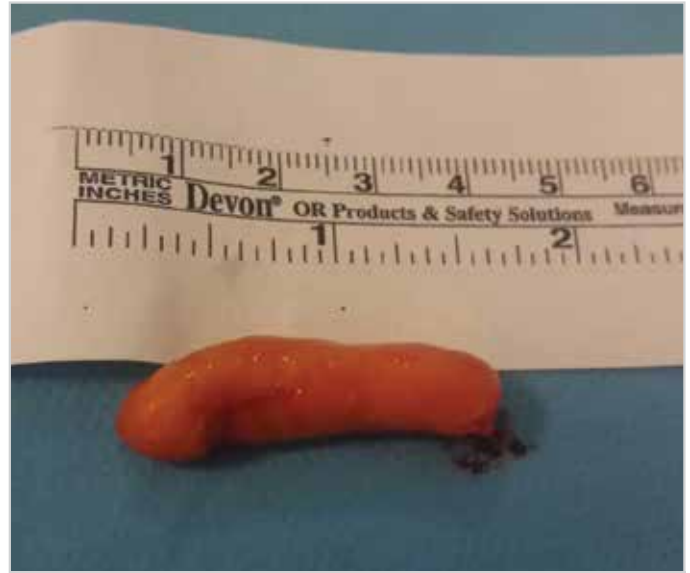
Figure 3. Excised chondrolipoma of the right tonsil