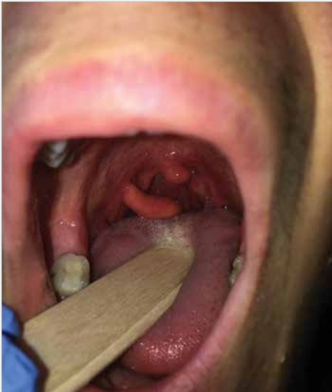
Figure 1. Chondrolipoma arising from the upper pole of the right tonsil