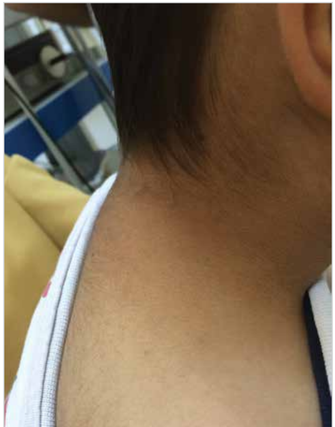
Figure 4. Physical examination at the third postoperative month revealing no recurrence

der by the family. Neither pain nor movement restriction was stated. His physical examination revealed a well-circumscribed, multilobulated, 5×3 cm, immobile, non-tender, non-pulsatile, fluctuating, cystic mass in right posterior cervical and supraclavicular region (Figure 1). The mass was evaluated with US and MRI scans. The US scan revealed a 55×40×35 mm, multilobulated, homogenous, cystic mass on posterolateral border of the sternocleidomastoid (SCM) muscle in the right supraclavicular region (Figure 2), whereas the MRI scan showed a 63×52×40 mm, well-circumscribed, septated, cystic mass in the lateral border of SCM muscle superior to the clavicle and anterior to supraspinatus muscle suggesting a hemorrhagic LM (Figure 3).