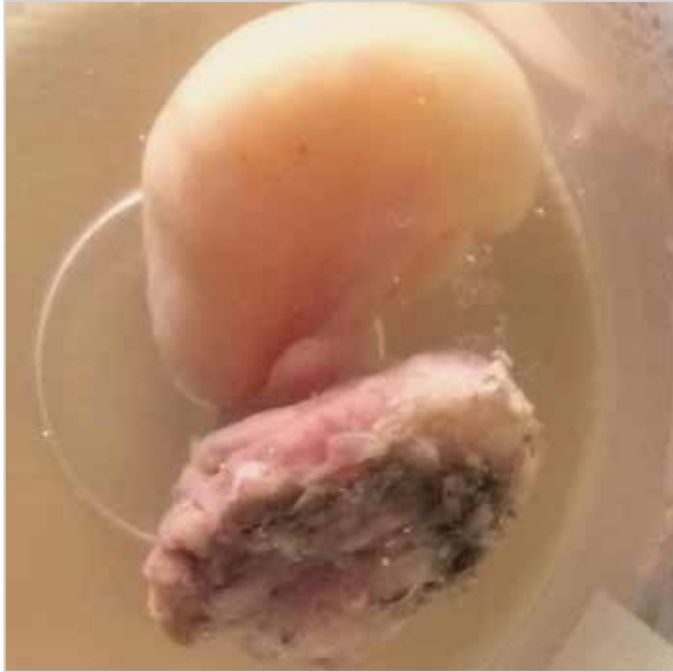
Figure 3. Surgical specimen of left tonsillectomy, including the polypoid mass, just after fixation