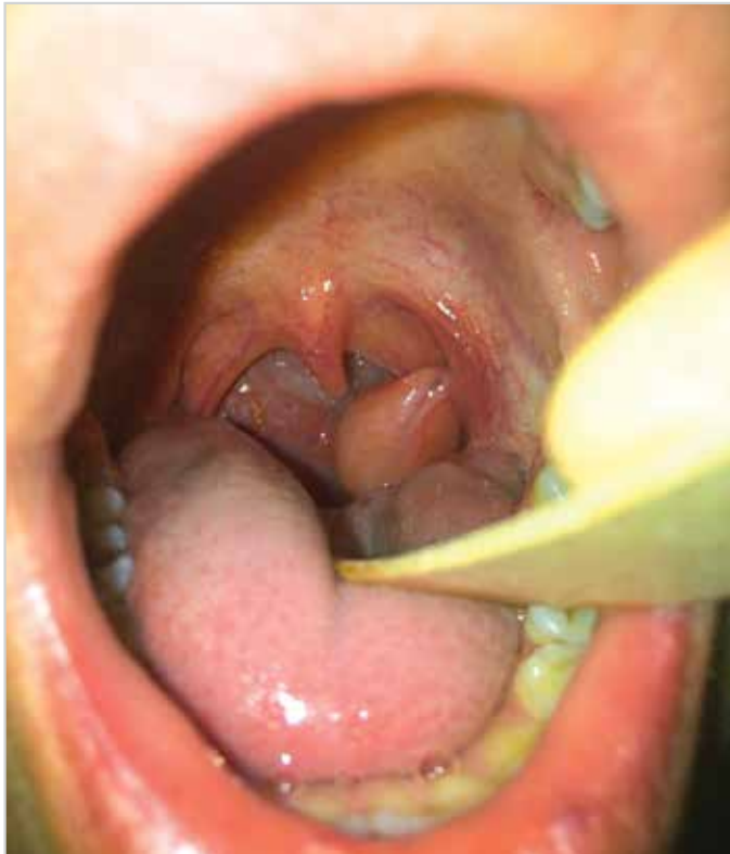
Figure 1. Oral cavity examination revealed a pale pink polypoid soft tissue originating from the left tonsillar fossa

Informed consent was obtained from both the patient and his father as a written document.