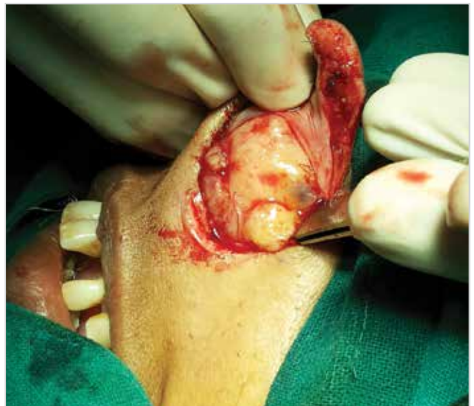
Figure 3. The lateral rhinotomy incision, elevated flap, and mass occupying the nasal cavity with an attachment on the septum