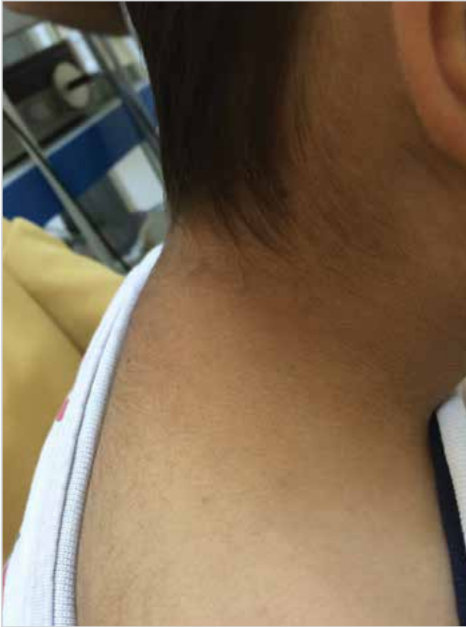
Figure 4. Physical examination at the third postoperative month revealing no recurrence