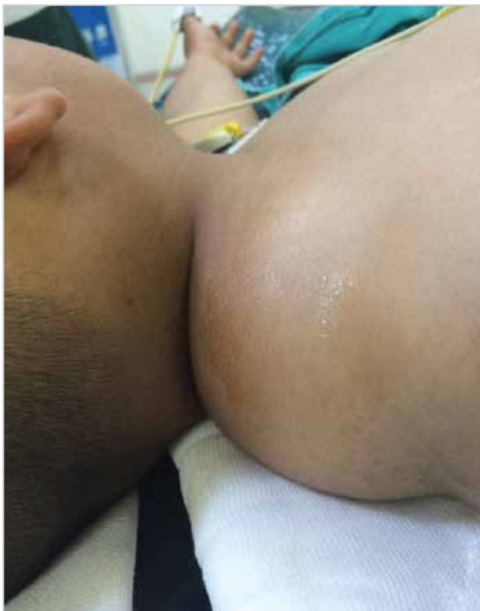
Figure 1. A well-circumscribed, multilobulated, 5×3 cm, immobile, non-tender, non-pulsatile, non-compressible, fluctuant, cystic in consistency mass in the right posterior cervical and supraclavicular regions