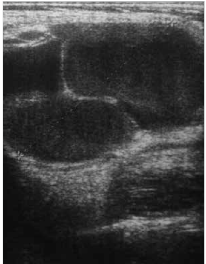
Figure 2. Ultrasound scan showing a 55×40×35 mm, multilobulated, homogenous, cystic mass on posterolateral border of sternocleidomastoid (SCM) muscle in the right supraclavicular region